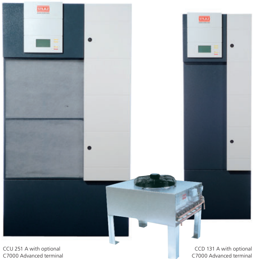
CCU 251 A with optional C7000 Advanced terminal

Unlike comfort air-conditioning units, which are not designed for permanent operation, MiniSpace with its microprocessor control ensures a precisely defined climate within narrow tolerances around the clock, 365 days a year.