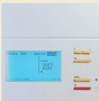
C7000 Advanced user interface

5) Condenser for type A units with R407C, condensing temperature 45°C, ambient temperature: 32°C