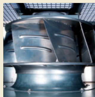
Maintenance-free EC fan